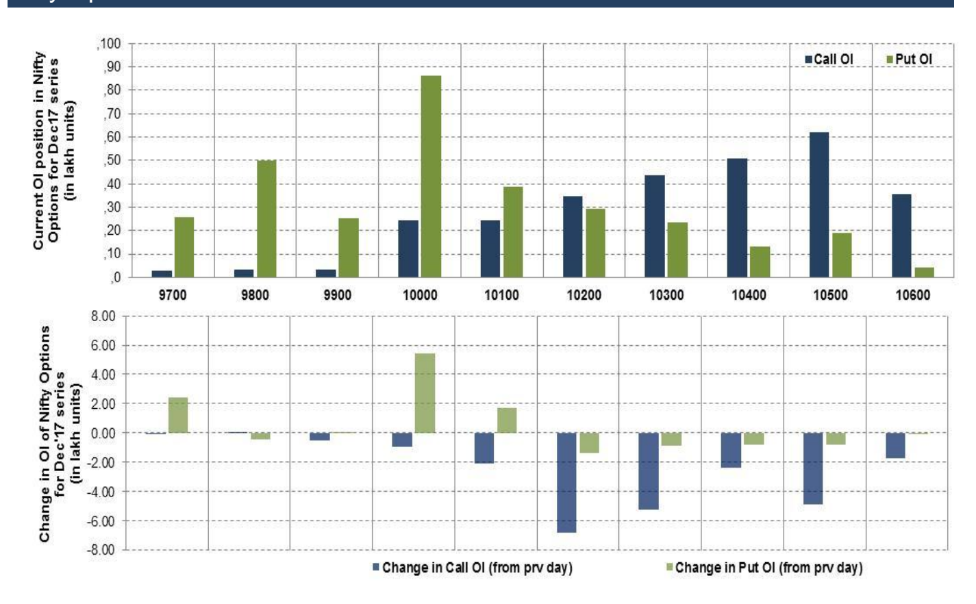
Note – Change in OI of Nifty Options refers to change from previous trading day Source-NSE, SIHL Derivatives Research (Institutional Equities)